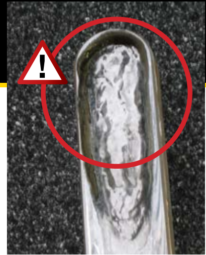
Dangerously eroded gage glass. Eroded glass is often not visible without inspection of disassembled gage.