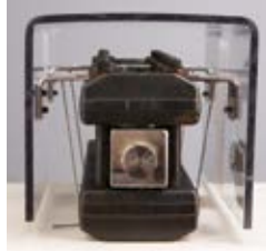
SafeView Shields mounting accommodates all standard flat glass gages.

– Project Engineer, Major Chemical Company